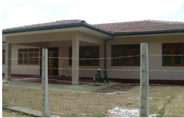
Probation Unit Office, Dehiyathakandiya