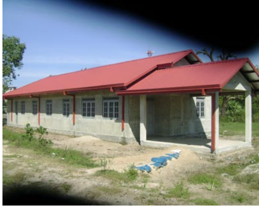
Probation Unit Office, Valaichenai