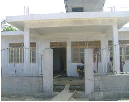
Probation Unit Office, Akkaraipattu